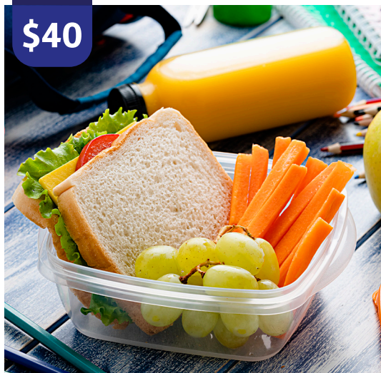
A Week's Worth of Healthy Lunches

With this gift, you can help fill up a hungry tummy with nutritious lunches for an entire week.