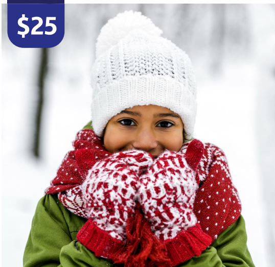
3-Piece Winter Hat, Gloves, and Scarf Set

Keep students warm with this winter set that includes a hat, pair of gloves, and a scarf.