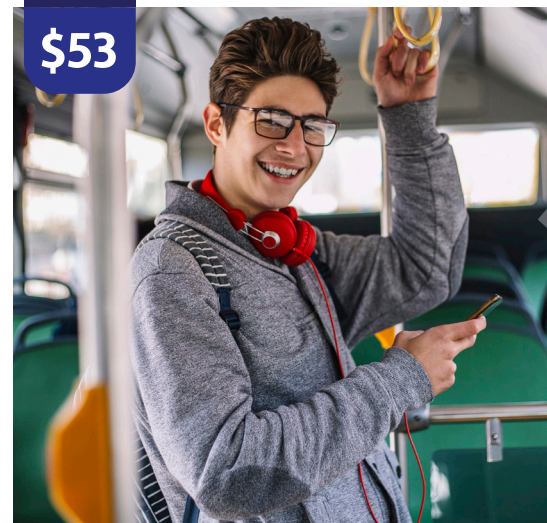
Durham Region Transit Youth Monthly Bus Pass

This bus pass for youth ages 13-19 provides unlimited travel and flexibility for a month.